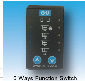
5 Ways Function Switch