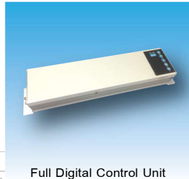
Full Digital Control Unit